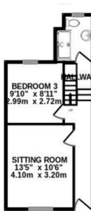
GROUND FLOOR 353 sq.ft. (32.8 sq.m.) approx.